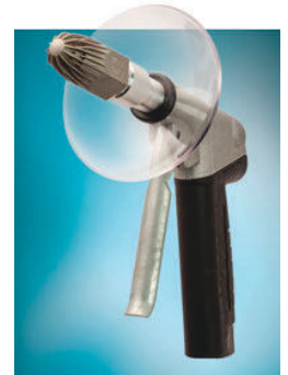
Model 1360SS-CS shown