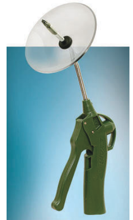
Model 1810SS-CS shown