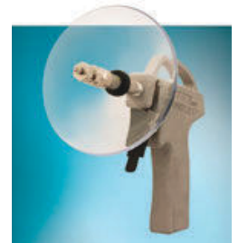
Model 1696SS-CS shown