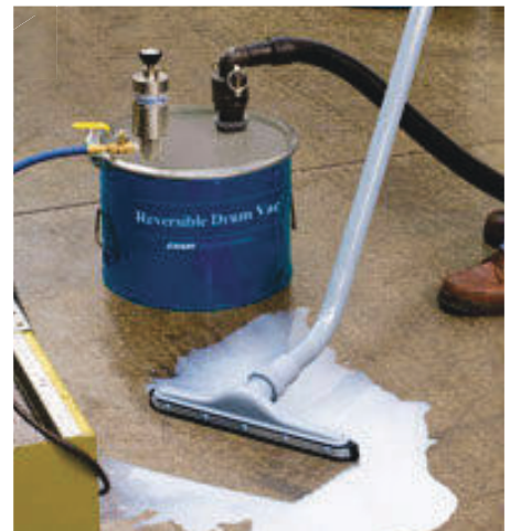
Model 6901 Spill Recovery Kit used with the Mini Reversible Drum Vac provides fast cleanup of messy spills.

EXAIR's Mini Reversible Drum Vac allows for quick and easy clean up of small messes.