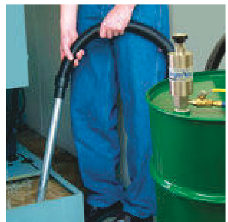
Reversible Drum Vacs are designed to fit the 3/4 NPT bung of any closed top drum. This model 6196-30 30 gallon system empties the coolant sump of a CNC.