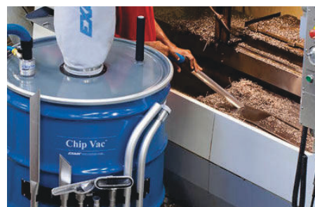
110 Gallon Chip Vac offers maximum capacity cleanup on a large machining operation.