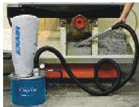
The Mini Chip Vac allows for easy clean up of small messes.