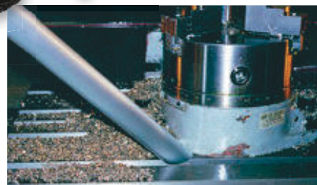
The Chip Vac removes abrasive stainless steel chips from a CNC.